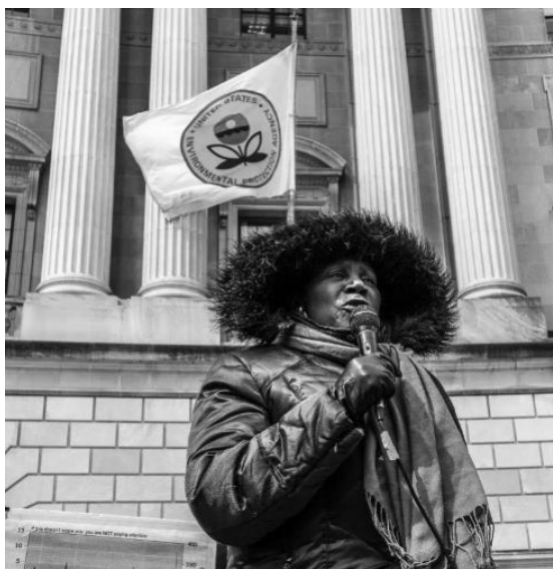
Congresswoman Sheila Jackson Lee at Rally for EPA

Congressman, as I am sure many of you have. The Association's Board of Directors is considering what further actions we should take as an organization. Your views on that question are most welcome.