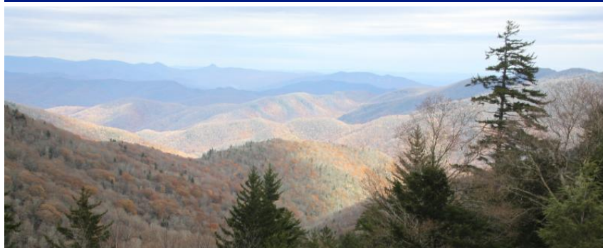
View from the Blue Ridge Parkway, NC