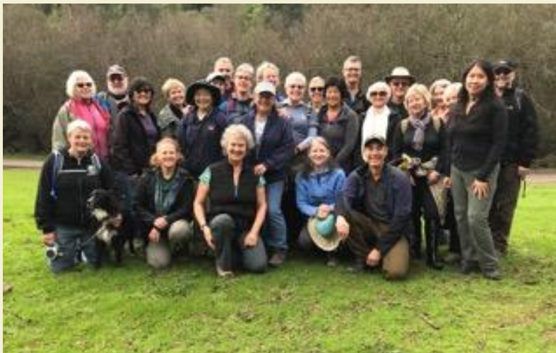
Bay Area Hikers

The Bay Area hiking group had an outing in the Redwood Regional Park in Oakland in January. This hike was special in that in addition to our 20+ regular Alumni hikers, we had 5 furloughed EPA Region 9 employees who joined up with us. They were very appreciative of being included in our hike and complimented us on the Operation Shutdown effort. We got an inside look at how staff is surviving the current Administration policies and the shutdown as well.