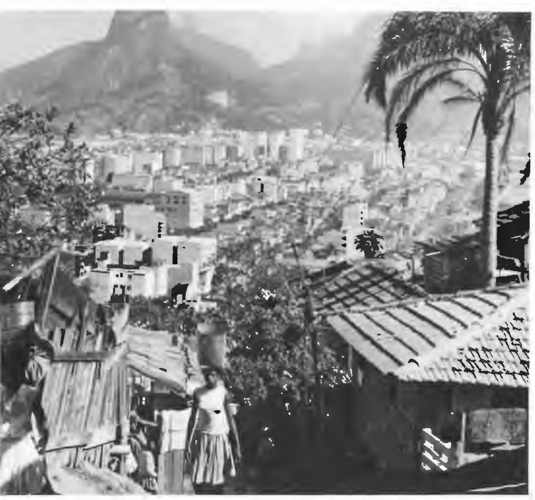
The urban poor crowd into slums on the outskirts of Rio de Janeiro, Brazil.

have the vision of overwhelming power—the primal explosion some ten billion years ago scattering 1,000 billion stars round 100 million galaxies, some of them many thousand times more powerful than our own sun by which all life on this planet in our small corner of the Milky Way is sustained. For the explosion itself set in motion the fusion of hydrogen nuclei which now fling off—since energy is matter's mass multiplied by the speed of light squared—the four million tons of "energy" from the sun which every second pervades our solar system and powers every living thing.