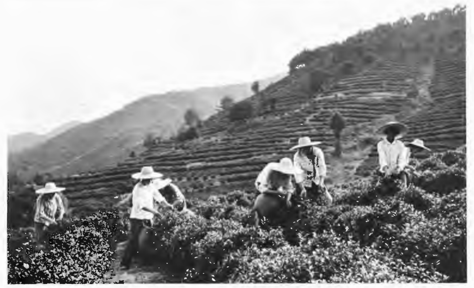
Workers pick tea leaves in China.