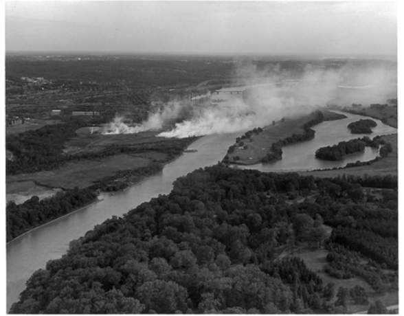
Figure 1. Waste was burned in the open at the Kenilworth Park Landfill on the banks of the Anacostia River, 1967.

In the decades before waste management was federally regulated in the United States, discarded materials contaminated land and waterways and posed increasing risks to public health. Waste was collected and dumped into unlined landfills or directly into rivers. Municipal landfills were usually located near rivers and streams, allowing liquids and refuse to migrate easily into the water supplies. Dumps were unsanitary, attracting rodents, giving off odors, and creating fire hazards. Trash was often burned in the open, contaminating land, water, and air. Liquids containing flammable and toxic chemicals were discharged into unlined “evaporation” ponds, allowing them to migrate into groundwater and waterways.