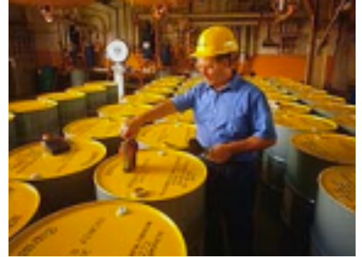
Figure 2. Safe management of hazardous waste under RCRA.

RCRA's requirements have led to the proper management and disposal of hazardous wastes in lined or covered landfills, surface impoundments, land application units, or deep well injection. They have also encouraged recovery of materials and energy and other safe reuses for hazardous wastes. Human exposures to hazardous wastes and contaminated groundwater have declined since RCRA's implementation. EPA has implemented a number of RCRA-focused partnership and award programs to encourage companies to modify practices to generate less hazardous and nonhazardous waste and to reuse materials safely.